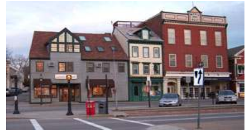
Downtown Newport, RI

Newport, Rhode Island is famous for being a popular summer resort town for wealthy New Englanders. Attendants of the annual MLA meeting were lucky enough to be able to visit Newport this year ... in the dead of winter. There was even a day or two of snow, which was very exciting to those of us who live in Southern California and see it rarely. Regardless of the cold weather, the town was beautiful, and the conference was enjoyable.