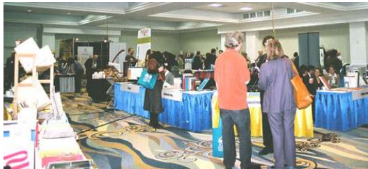
Scene from the MLA exhibit hall

I was especially interested in some of the cataloging-specific sessions, including an RDA update, a “BCC News Hour” (reporting on breaking news and reports in music cataloging, sponsored by the Bibliographic Control Committee), and a program on music vocabularies and subject access. The conference program was full of interesting-looking sessions, and several times I had to make difficult decisions about which ones to attend (or do some ballroom-hopping to catch snippets of several