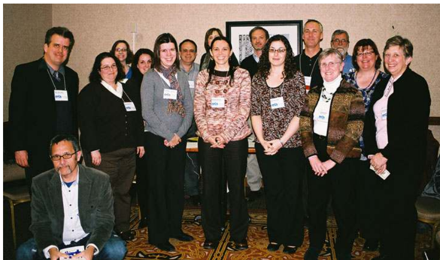
Members of MLA/ Southern California Chapter (Picture taken during the chapter meeting at the MLA conference in Newport, RI.