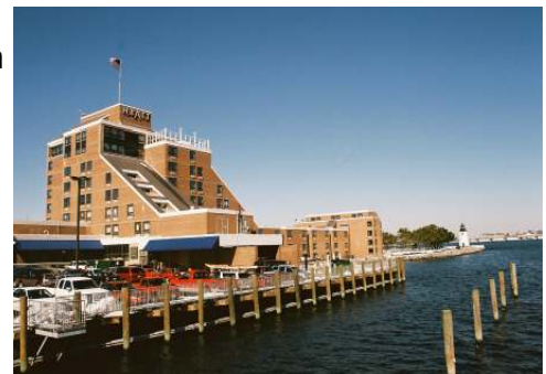
Hyatt Regency Hotel and Spa

We met at the Hyatt Regency Newport Hotel and Spa, which I’m sure will be a nice place ... when the renovations are finished. Construction was supposed to be done by the time MLA came to Newport, but unfortunately, it was still in full swing. The majority of conference-goers were relocated to the nearby Marriott, and shuttle service was provided between the two hotels. We all had the experience of entering the hotel through a tent on one side, and walking down a corridor with a soaking wet carpet (squish squish!) to get to the restaurant and several conference rooms. Damp pants hems were seen on many.