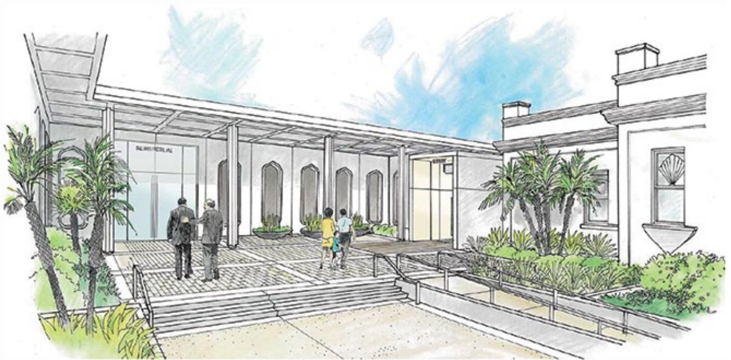
Architect's rendering of Brand Library upon completion

One of the most fascinating aspects is the restoration of the historic look to the front rooms. The original building was a private residence built in 1904, which was later donated to the City of Glendale to become a library. Quite a few hidden details are being uncovered during the renovation. There are also a few architects' renderings of how the building will look when the project is complete. We have received quite a bit of positive feedback on these photos, so take a look!