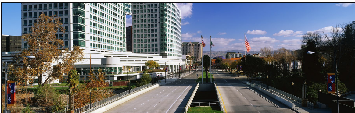
San José, CA, site of the 2013 MLA annual meeting

A spell ago, I immersed myself in both classical piano composition and popular songwriting through a BFA at CalArts. These days, I enjoy scoring for films (mainly piano) and writing music under the moniker Musical Care.