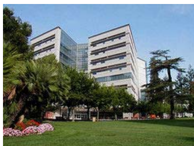
http://www.sjlibrary.org/about/library_photos.htm SJPL on Flickr

Music Library Association—Northern California Chapter