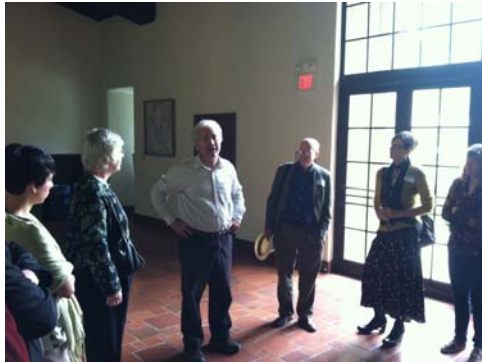
The ceilings of both the lobby and the concert hall were intricate and stunning in different ways.