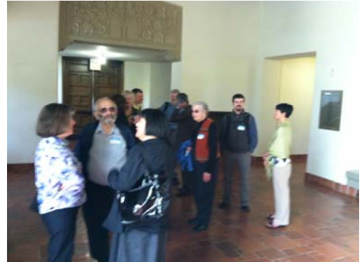
NCC members gather for a tour of music facilities at Mills College on May 21, 2012.

A gentle reminder that the MLA/NCC membership year runs from September 1 through August 31. Dues of $10.00 are payable at the Fall Meeting. Please check with the NCC Secretary/Treasurer to make sure your registration is up-to-date.