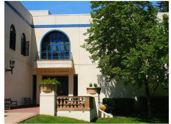
F.W. Olin Library, Mills College