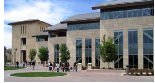
SCU Library http://www.scu.edu/library/info/directions/