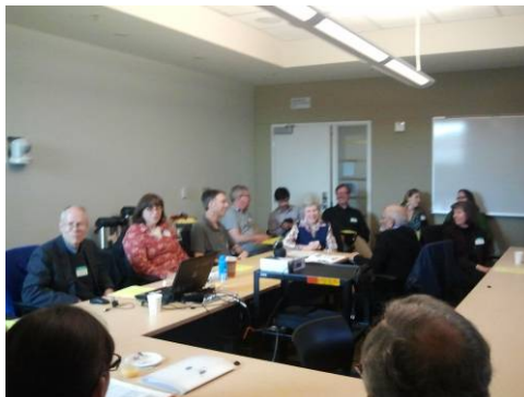
NCC members gathered at SCU for the Fall 2011 meeting.